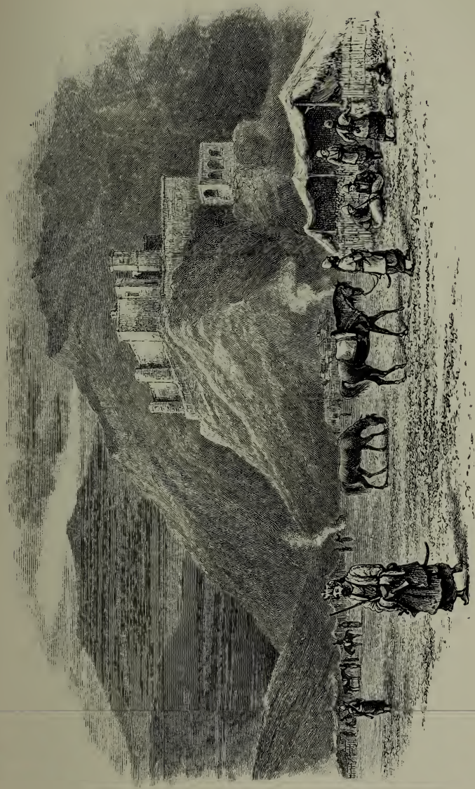
VIEW OF KALA TUL, THE RESIDENCE OF THE BAKHTIYARI CHIEF.