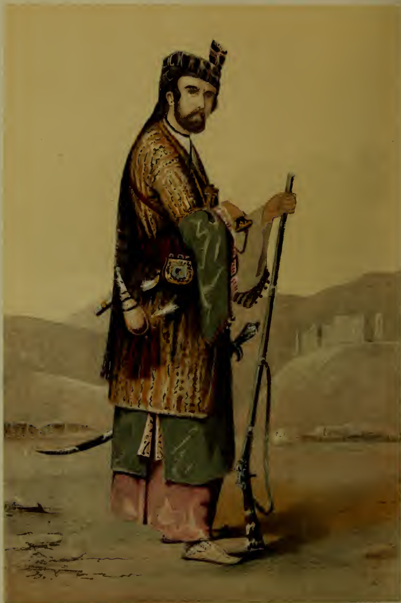
SIR A. HENRY LAYARD IN BAKHTIYARI COSTUME.