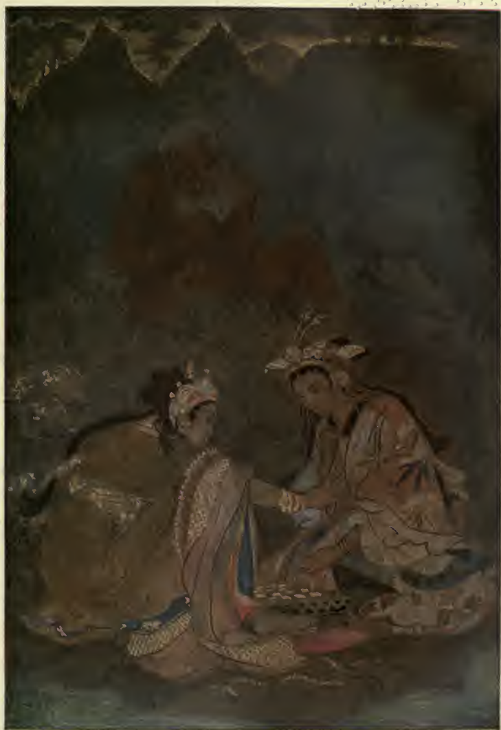
Visu on Mount Fuji-yama.