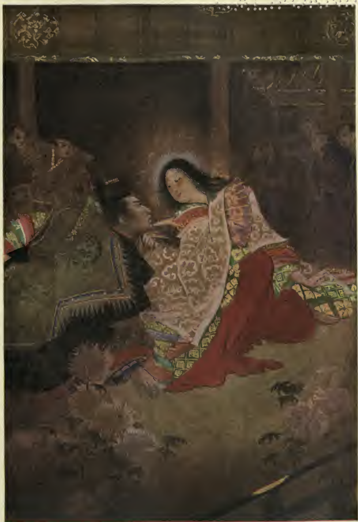
The Mikado and the Jewel Maiden.