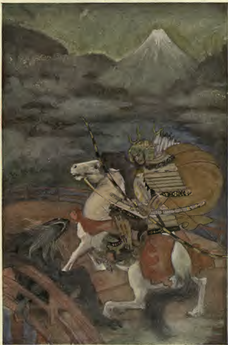
Tōtarō and Samébito.