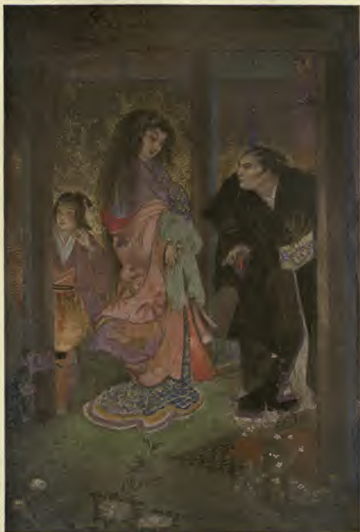
Shinzaburō recognised Tsuyu and her maid Yoné.