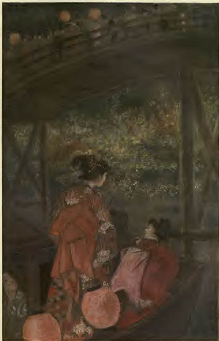
The Firefly Battle.