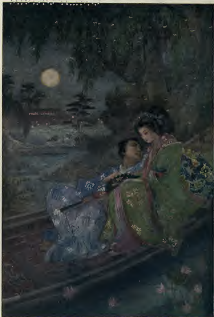
The Lovers who exchanged Fans.