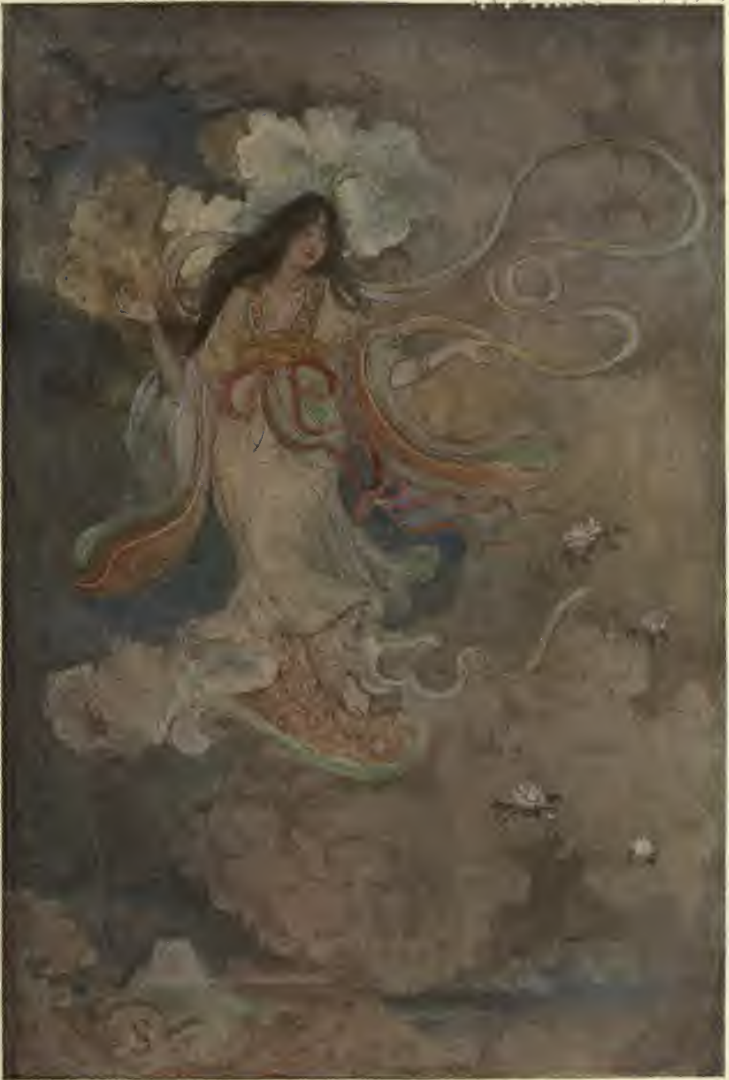
Sengen, the Goddess of Mount Fuji.