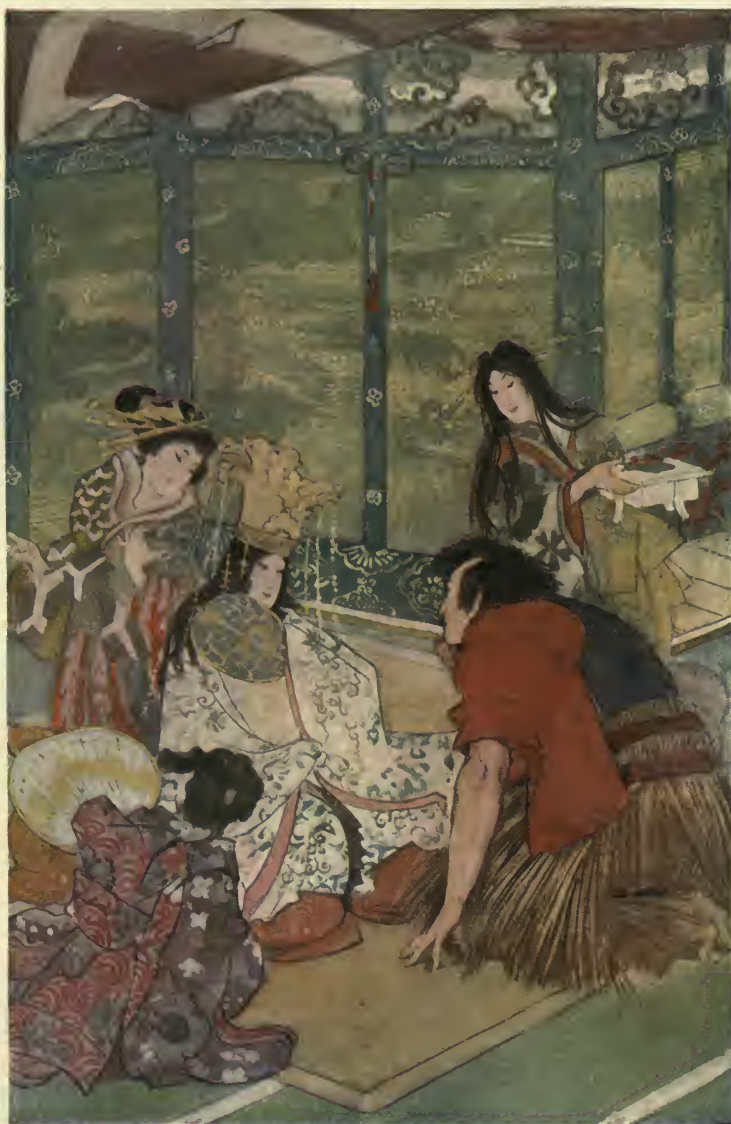
Urashima and the Sea King's Daughter