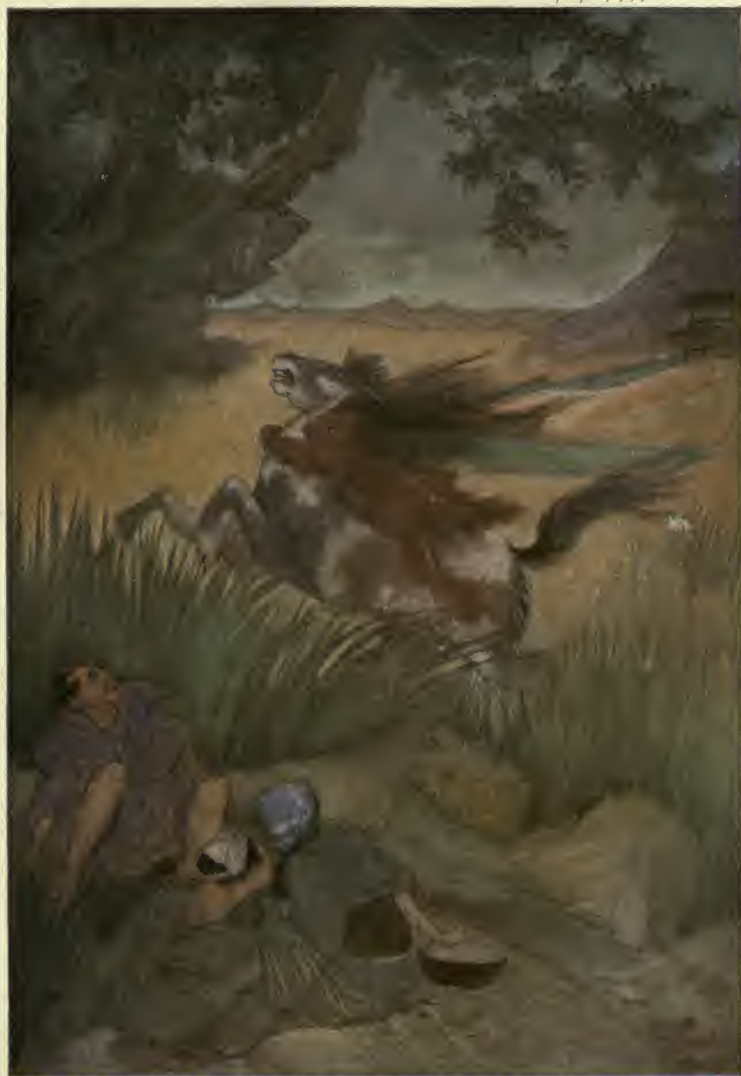
The Kappa and his Victim.