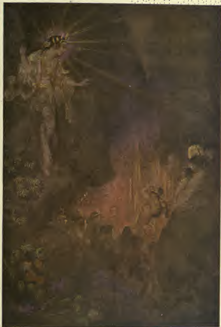
Uzume awakens the curiosity of Ama-terasu.