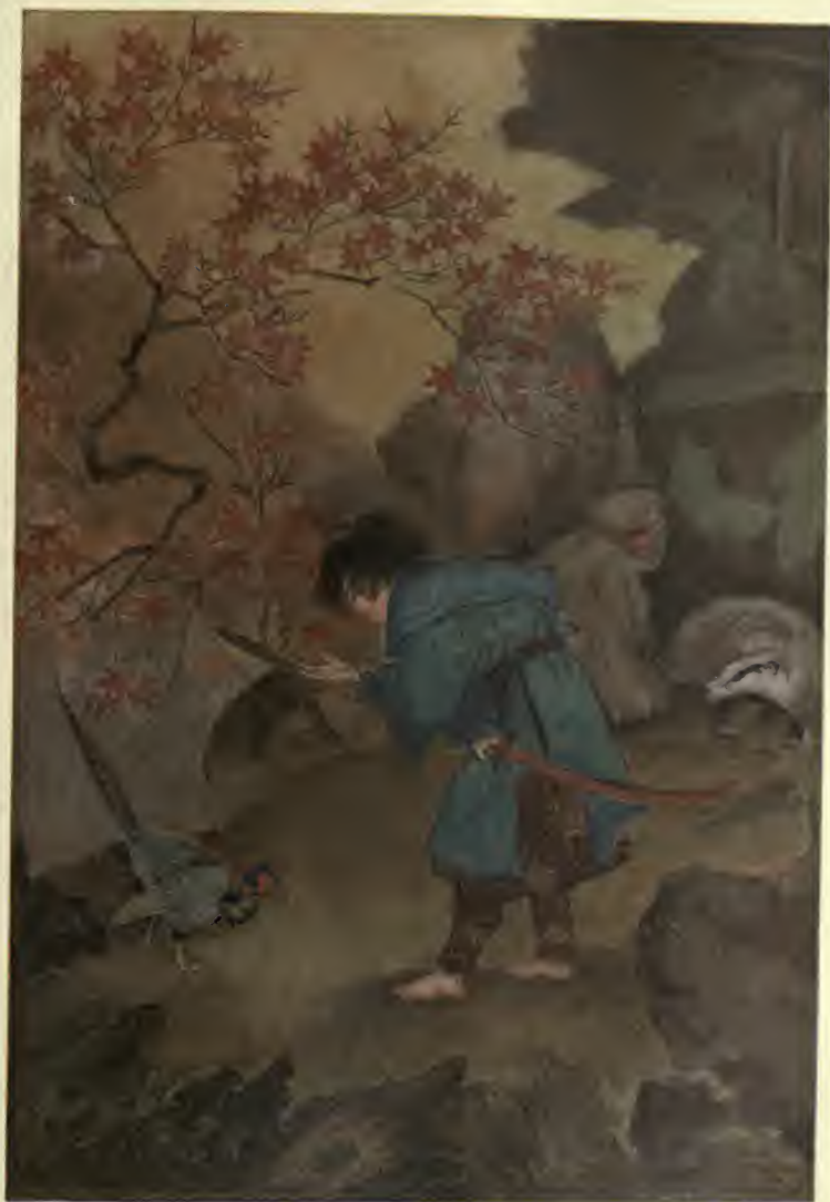
Momotaro and the Pheasant.