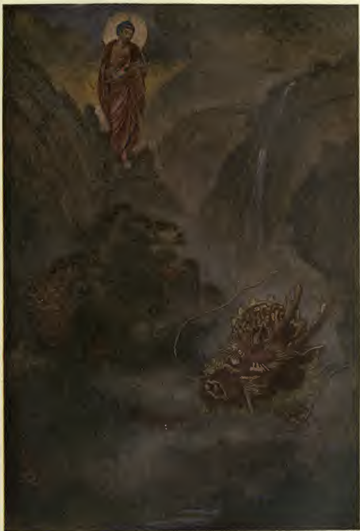
Buddha and the Dragon.