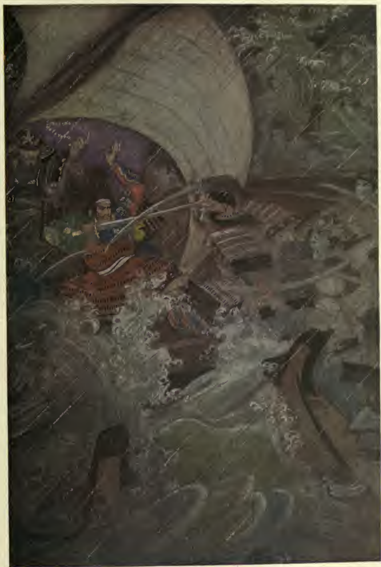
Yoshitsune and Benkei attacked by a ghostly company of the Taira Clan.