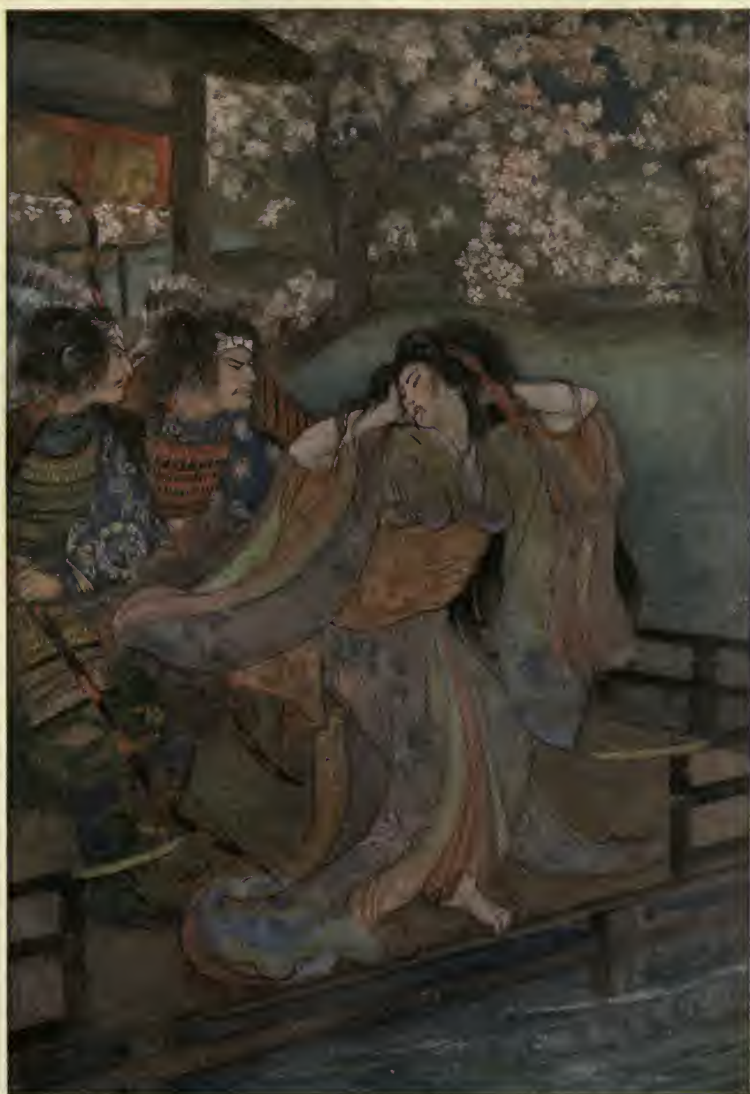
The Maiden of Unai.