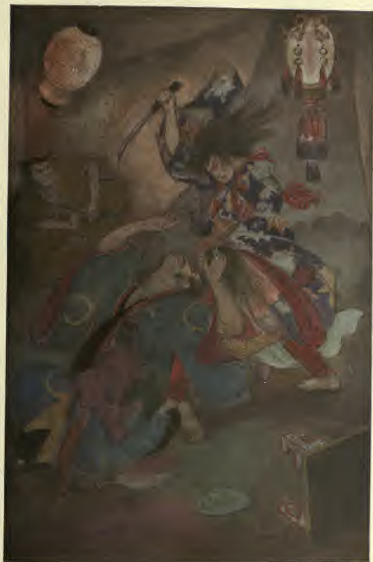
Prince Yamato and Takeru.