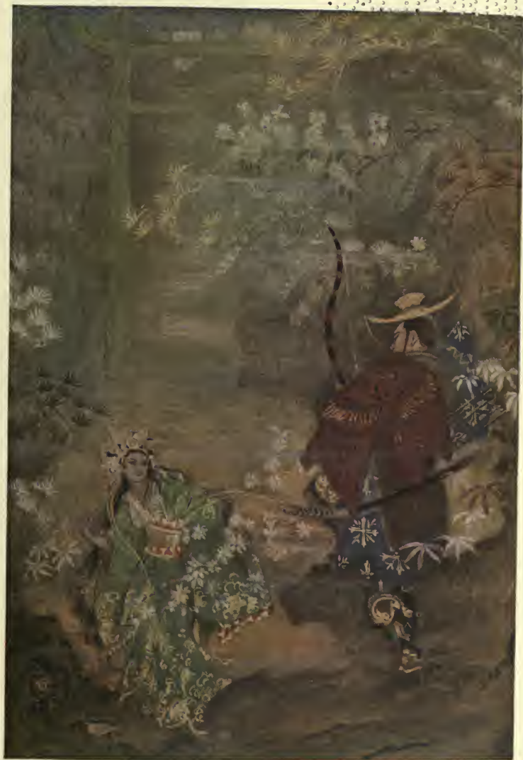
Hoori and the Sea God's Daughter.