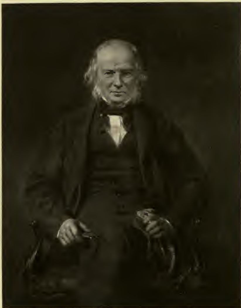
Photogravure by Arman & Sams.